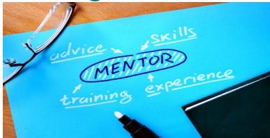
Get mentoring services with SCORE.

SCORE is a volunteer organization dedicated to assisting small businesses with their issues. SCORE counselors offer mentoring services and advice in a range of topics from startups to growth, business planning and marketing. Attendees are encouraged to bring questions, and can schedule an appointment for additional personal sessions. To register or receive further information call 203-783-3292.