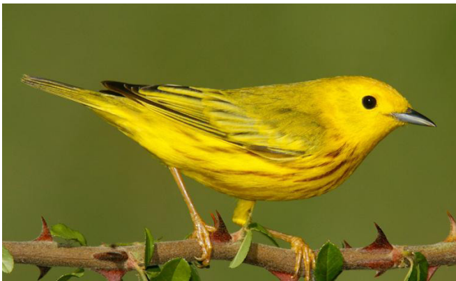
American Yellow Warbler

Leashed dogs are welcome when outside the fenced dog park area.