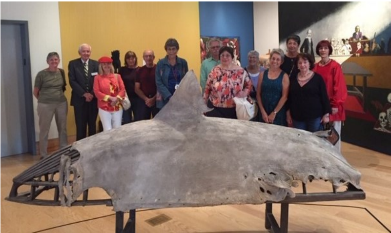
Friday with Friends at the Ireland’s Great Hunger Museum.