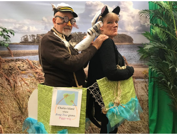
Most Creative: The Owl & the Pussycat