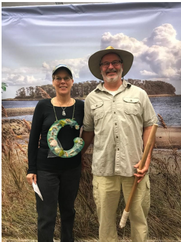
Most Literary: The Old Man and the “C”