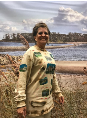
Judge’s Choice: Treasure Map