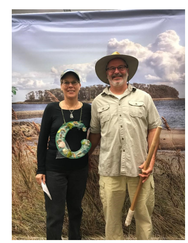
Most Literary: The Old Man Schools. and the "C"