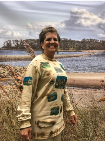
Judge's Choice: Treasure Map

FOML Newsletter Page 2 December 2018 FOML Newsletter Page 3 December 2018