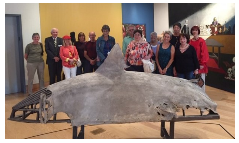
Friday with Friends at the Ireland's Great Hunger Museum.