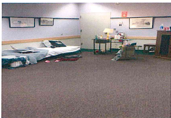
Mock teen bedroom set up