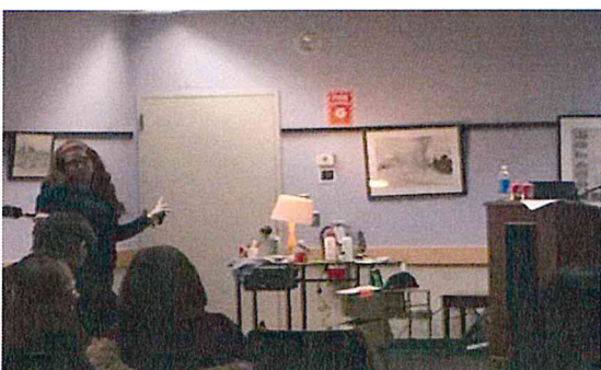
Presenter showing one of the many items (hair brush) with secret compartment